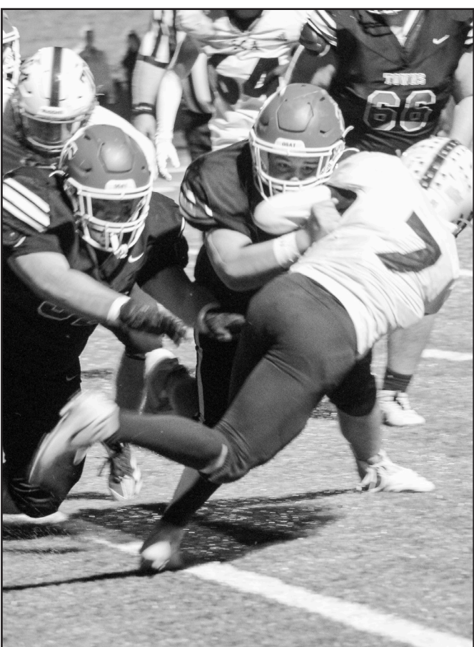
The Towns County defense turned in another heroic performance in Friday's 21-14 win.

Barrett also had 3 touchdowns, 2 catches for 13 yards and 10 tackles. Walker also had 1 interception and 1 tackle for a loss. Jacob Nicholson made 11 tackles, 1 sack and