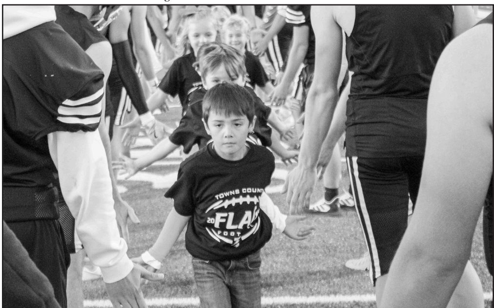
Friday night was Rec Night at Towns County High School.