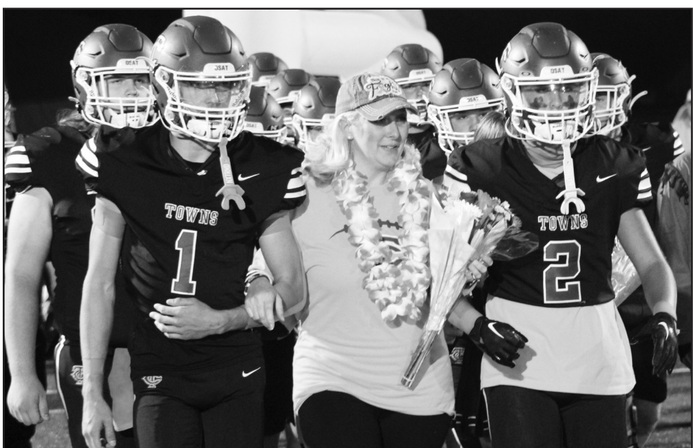
TCHS hosted its annual Pink Out game for cancer awareness.

Tickets can be purchased at GoFans or at the gate. Come and see the boys in action.